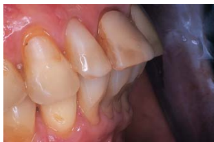
Figure 10—Preoperative view of the severe gingival abrasions and “splayed” appearance of the upper incisors.