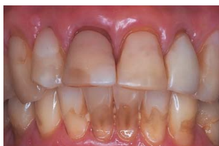
Figure 1 —Preoperative anterior view.

Classification "Type 1+" mobility was noted on teeth Nos. 23 and 26, with "Type 3" mobility noted on teeth Nos. 24 and 25. The patient had an edge-to-edge incisal relationship with severe abfraction wear on teeth Nos. 23 through 26. The abraded areas had worsened during the past 5 years as described by the patient and her records, as a result of the occlusal disharmony of her anterior bite. 5 She exhibited a cuspid-guided occlusion bilaterally coupled with anterior excursive interferences (Figure 3). Splaying of the lower incisors was also noted in excursive movements. The patient experienced no discomfort when chewing but did express concern about the obvious abrasions evident on the lower incisors. She noticed that the incisors were loose but expressed no difficulty with mastication. In October 2000, her previous dentist diagnosed approximately 70% bone loss around teeth Nos. 24 and 25 (Figure 4). In April 2002, a periodontist recommended that she splint her mandibular incisors together for stability, which led to the placement of a Ribbond-supported (Ribbond, Inc) composite splint (Figure 5) <QA: Because of our Fair Play Policy, please mention several other splints that could have been used for this procedure.>.