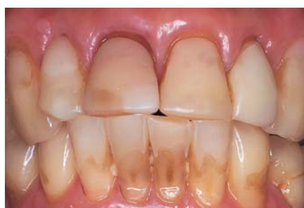
Figure 3 —Anterior view showing patient just beginning to excurse into right working <QA: is this sentence finished?>. Anterior interferences do not allow for a smooth working motion.