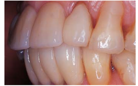
Figures 6 through 8 —Postoperative anterior, right side and left side views. Besides improved esthetics, the overjet and overall shape of the teeth was dramatically improved.

moved with hemostats. This involved using a Midwest 245 carbide bur (Dentsply Professional) to carefully cut the temporary into separate parts. Finishing burs, like this one, cut smoothly without “jumping” during the process. The temporary was then sectionally removed with the hemostats without imparting too much stress on the mobile teeth.