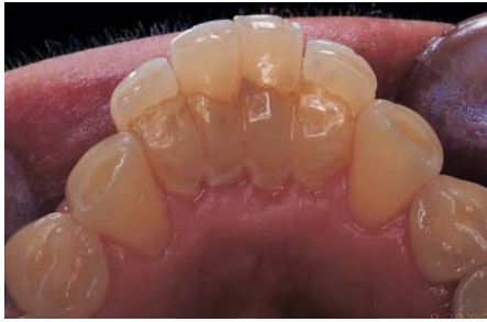
Figure 5 —Occlusal view of splint in place. Plaque and tartar accumulation was evident.