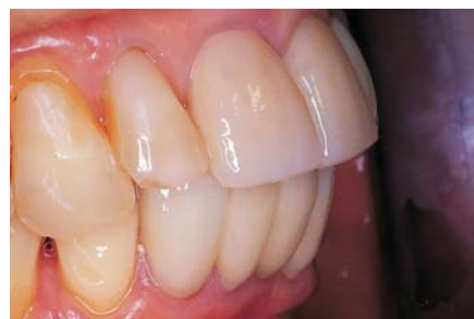
Figure 11—Postoperative view demonstrating the improved overjet and appearance of the incisors. The patient’s cuspid-guided excursions are now unimpeded by her incisors.

office 3 months later for a postoperative visit, which included reassessment of all pocket depths and a detailed tissue evaluation. A second follow-up visit was completed 3 months after that—6 months since seating permanent crowns—for reevaluation. The table above shows the results of the mobility analyses