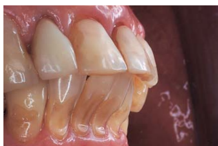
Figure 2 —Preoperative, right side, anterior view. Notice the severe abfraction lesions and overjet relationship.